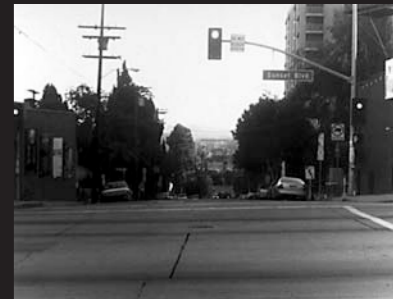
Jonathan Monk, None of the Buildings on Sunset Strip , 1998, 33 black and white photographic prints, 11 x 14 in. each

Today the "dual time" of the cover—a time that belongs to a "before" that continues revealing itself in the "now"—is finding its way into many spheres of creativity, not just music. To take but a few examples in and around the art world, think about Gus Van Sant's Psycho (1998), or the artistic duo Iain Forsyth and Jane Pollard's maniacally detailed re-